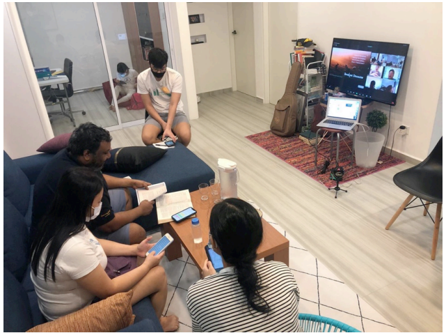
SEMI-VIRTUAL/PHYSICAL MEET UP

Leading an AG can be quite a perplexing role. Most people sort of know what an AG Leader does. AG Leaders themselves have a rough idea of what’s required of them. But somehow, what the AG Leader actually does can be quite different from all of the above! It’s a little like that meme where “what my friends think I do” versus “what my parents think I do” versus “what I think I do” and “what I really do” are all completely different. I know this from personal experience as an AG Leader too!