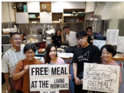
Some of our volunteers for Friendship Meal Dec 2017

The Living Room collaborated with many other church ministries, and it organized many initiatives to bless our neighbours – including the Friendship Meals, our Food Aid @ Bishan program during the COVID pandemic, and our Befriender program at Sin Ming Block 410.