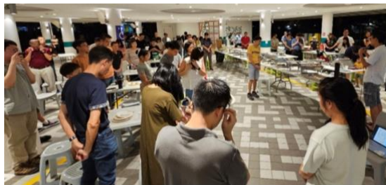
Thanksgiving Prayer at the Living Room 10 th Anniversary Dinner

Oh, taste and see that the LORD is good! (Psalm 34:8)