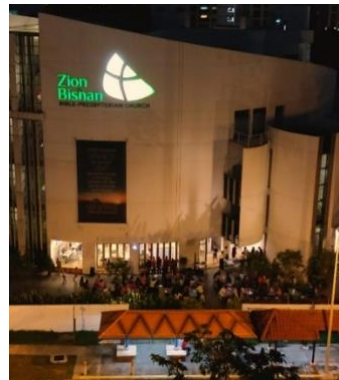
Friendship Meal Dec 2018; a view from across the street.