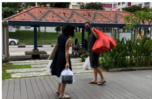
Members delivering cooked food to needy families during the COVID pandemic, as part of our Food Aid @ Bishan program (April – July 2020)

And so, as the Living Room ministry celebrated her 10 th anniversary on Saturday 19 th April. I could not help but be filled with much joy and thanksgiving.